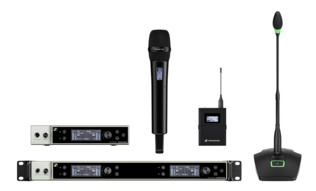
The EW-DX components at a glance

Sennheiser's wireless set-up would not be complete without evolution wireless G4 and AVX camera solutions, as well as the Digital 6000 microphone series, including the Wireless Systems Manager software, EK 6042 digital/analogue camera receiver and various clip-on and headset microphone options. Evolution wireless IEMs will be on show alongside the IE PRO series of in-ears and various headphones, including the HD 400 PRO, and broadcast headsets.